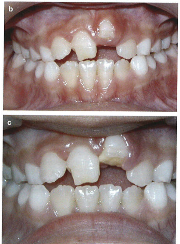
Fig. 3. Injuries to the developing teeth. An 8-year-old girl sought treatment because of delayed eruption of tooth 21. The history revealed that she fell three steps from the stairs while using the baby walker. Recommendations on oral hygiene and follow-up controls were given at the Emergency Room. Teeth 51 and 61 apparently were not affected and had normal resorption at the time of shedding. (a) Hypoplasia of tooth 11 affecting the incisal third of the crown. Crown dilacerations is seen in tooth 21. (b) Clinical appearance of tooth malformation affecting both central incisors: hypoplasia with loss of tooth structure in tooth 11 and delayed eruption is observed in tooth 21. (c) After completion eruption, crown dilaceration is seen in tooth 21.