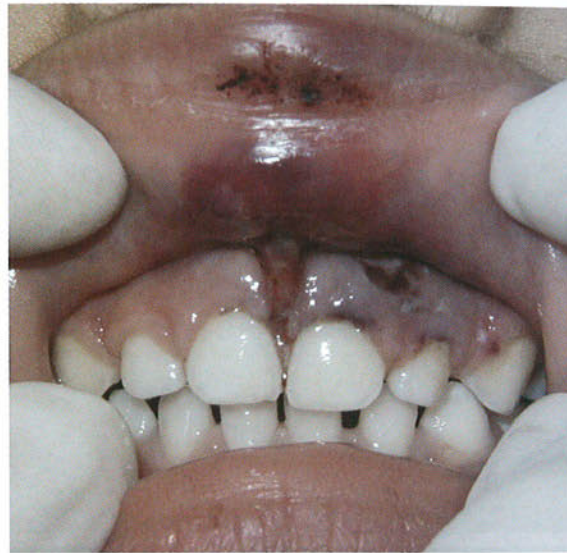
Fig. 1. Soft tissue injuries of the upper lip and torn frenum.

In more severe injuries, especially, when there is bleeding of the lips and intra-oral soft tissue, the