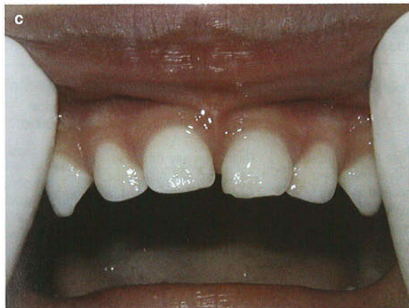
Fig. 4. (a) A 2 year and 6 month-old boy fell while he was jumping on the bed. The mother noticed that the left central incisor was displaced and sought emergency treatment immediately. Instructions on oral hygiene, including topical use of chlorhexidine gel using cotton swabs for one week, were given to the mother. Also, it was recommended a soft diet for 2 weeks along with restricting the use of pacifier. (b) An occlusal view at the time of injury shows an overlapping of the primary roots and the developing permanent incisors; however, it is possible to observe an apical increased periodontal ligament space. (c) Spontaneous reposition of tooth 61 at two and a half months follow-up control.

The child's maturity and ability to cope with the emergency situation, the time for shedding of the